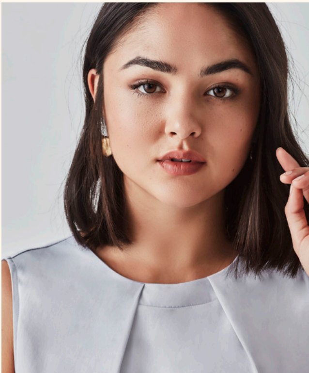
ESTELLE Easy-care, wrinkle free blouses