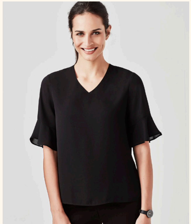
ARIA Available in 7 different colours