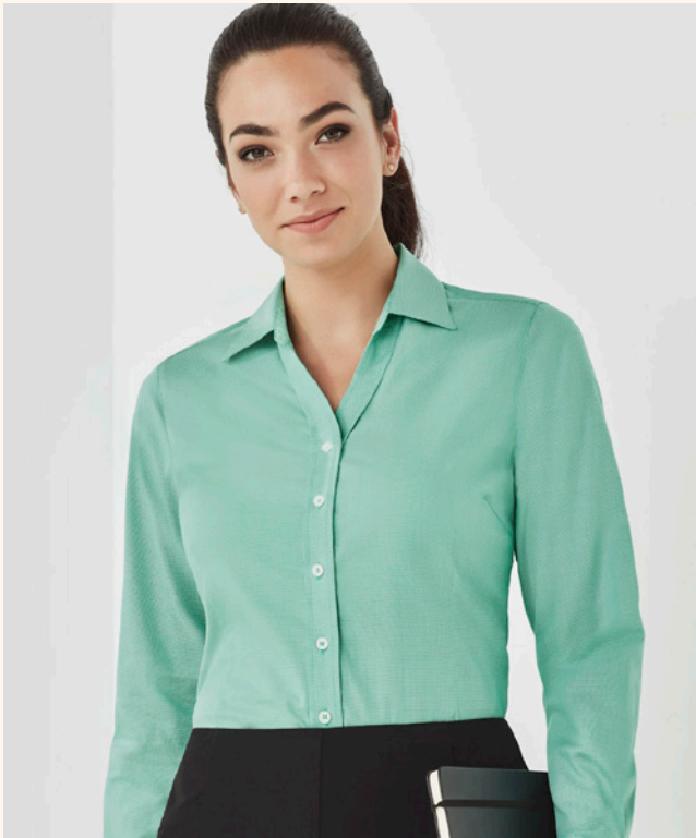
HUDSON WOMEN Built for work, designed for comfort